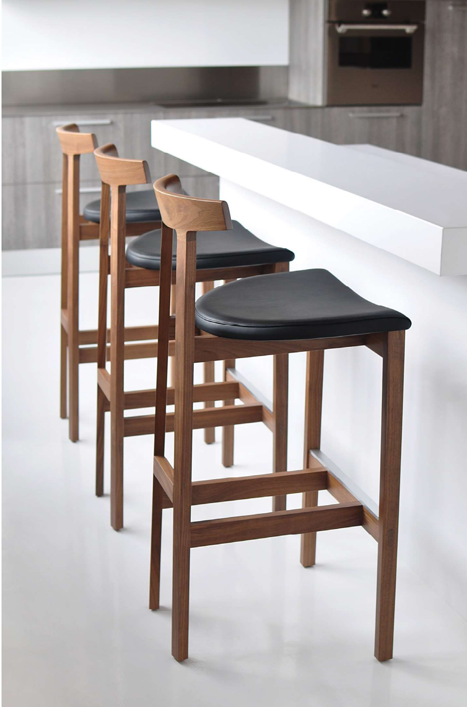
Torii Bar Stool & Counter Stool